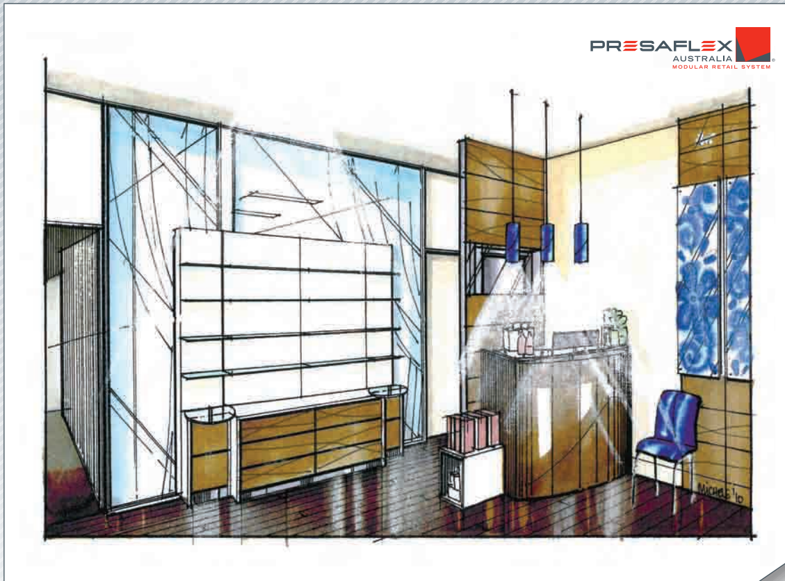
Demodeks Systems Presaflex concept sketches – Note the use of full height Presaflex frames with graphic panels, double-sided Presaflex frames to create division walls, and Presaflex product display and storage drawers.