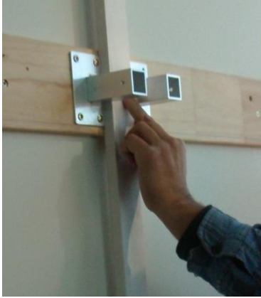
1. Mark cement wall batton plaster wall to specs

(Detailed installation manuals and fitting instructions are supplied with each product)