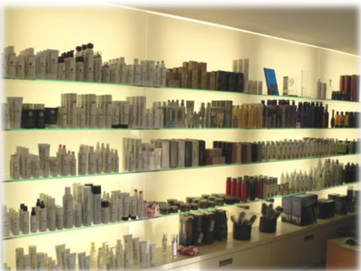
Backing can be back-lit