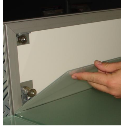
3. Starting from bottom apply backing, then shelf, then backing, until reaching top end of frame