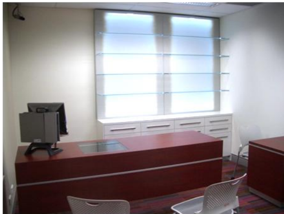
Pharmacy Australia Center of Excellence, Brisbane