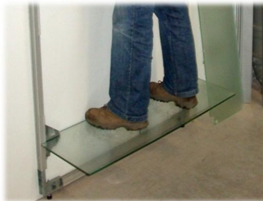
Innovative clamp support up to 80 kg