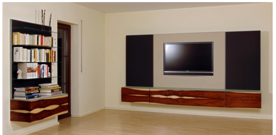
Private residence, Gold Coast