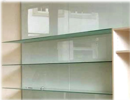
Shelves are self supporting – no brackets needed