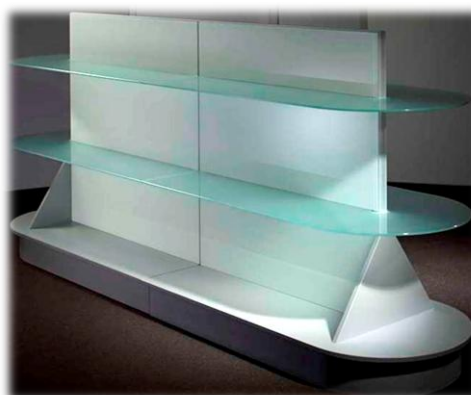
Can be assembled as a Gondola