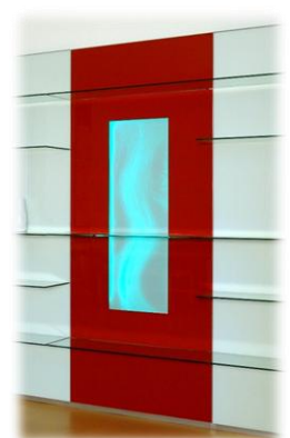
Water feature available