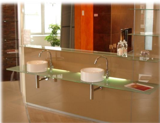
Rustproof, ideal in wet/humid environments