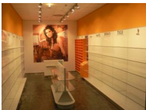
Side by side