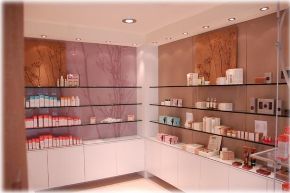
Backing is interchangeable and fully customizable