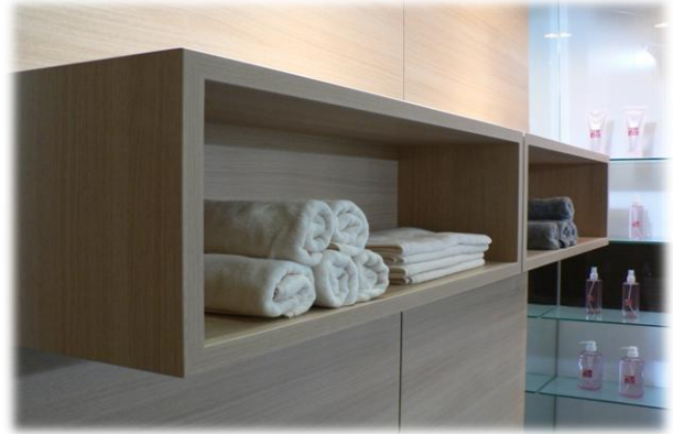
Frame can support boxes and /or cabinets