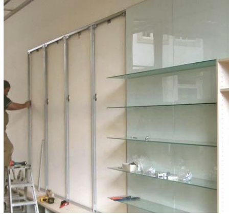
2. Fix frame to wall/batton