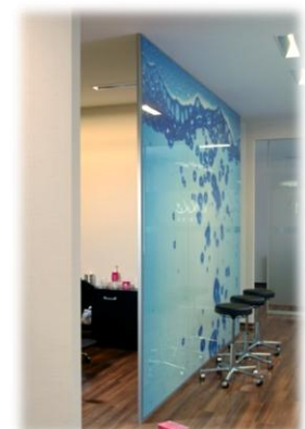
Can be used as partition