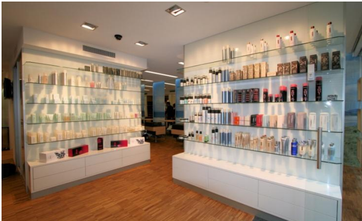
Hair Salon, Sydney