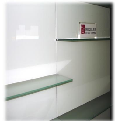
Can be arranged as a step-display