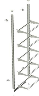
Only 7 SKU's per unit