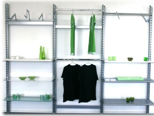
Build Scalable, from basic to complex configurations