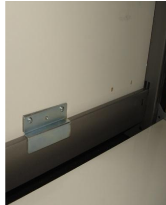
3. Slide backing in place