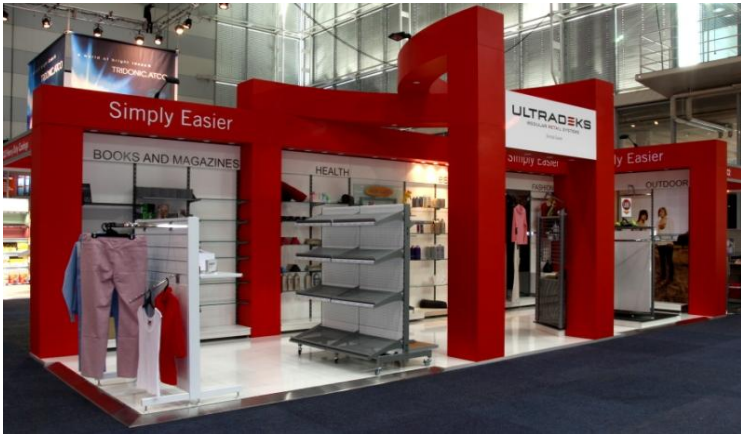
Retail Expo, Sydney