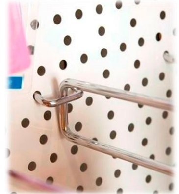
Perforated metal backing available