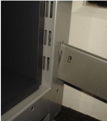
1. Assemble frame

(Detailed installation manuals and fitting instructions are supplied with each product)