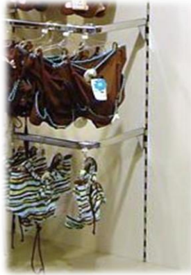
Frame placed behind panels