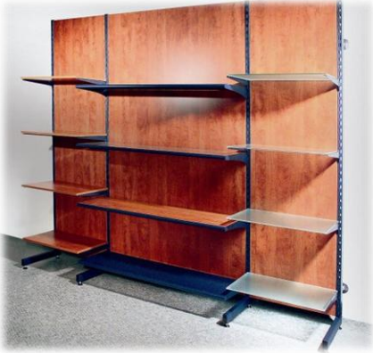
Compatible with existing systems