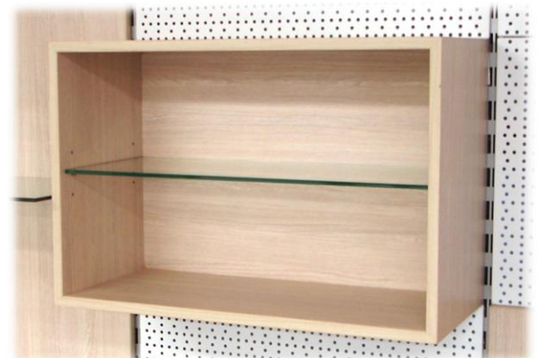
Boxes and cabinet hang on frame