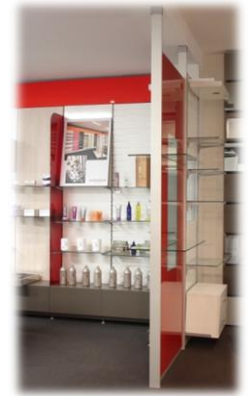
Can be used as a partition