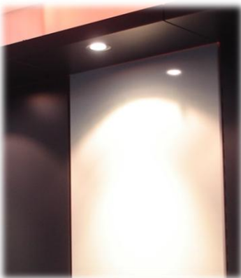
Custom made pelmets and plinths