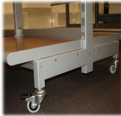
Frame can be on casters