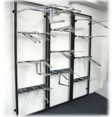
Vast Range of accessories