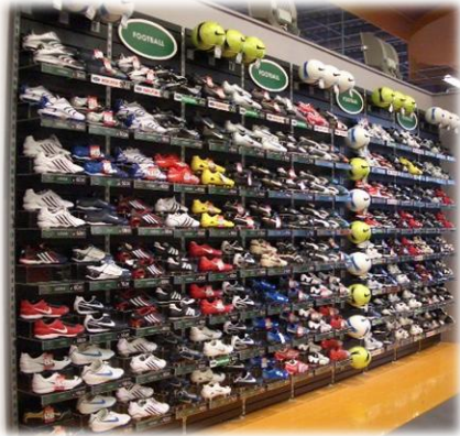
Perfect for high density shelving