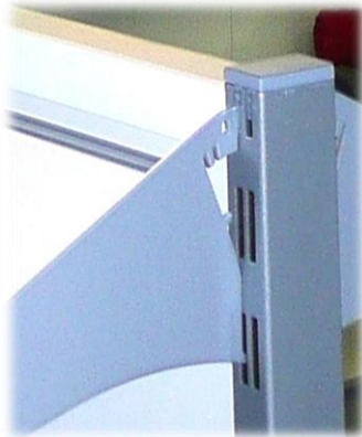
Shelves adjust on 60°, 90° and 120°