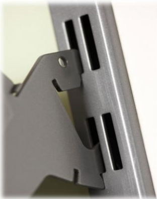
Modules simply lock in place