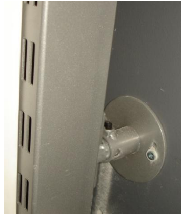
2. Fix frame to wall/batton